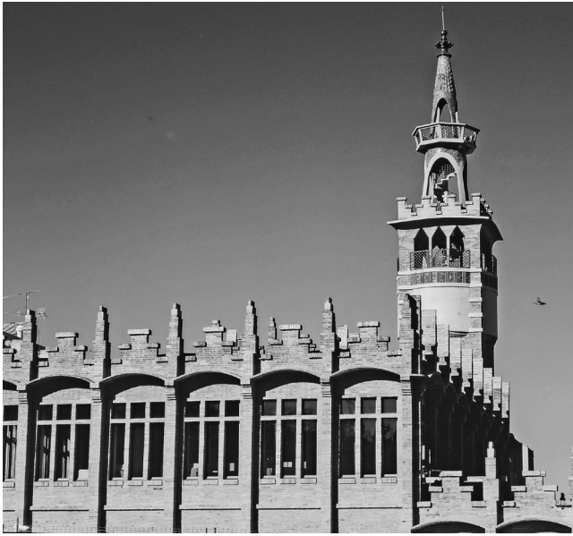
FIGURE 3. Close-up of the Casaramona factory with one of the towers housing the water tanks.

buildings with markedly horizontal lines. The two main buildings run parallel to each other and are aligned with the opposite streets, and they consist of a low central body and two other symmetrical bodies on the ends which are twice as high as the central one, with the goal of creating an indoor space which optimises ventilation and light through a second row of windows. In the middle is another low building upon which rest the towers, whose verticality counterbalances the linearity of the buildings. All the buildings are separated by narrow walkways to make it easier to move goods while also serving as fire-breaks.