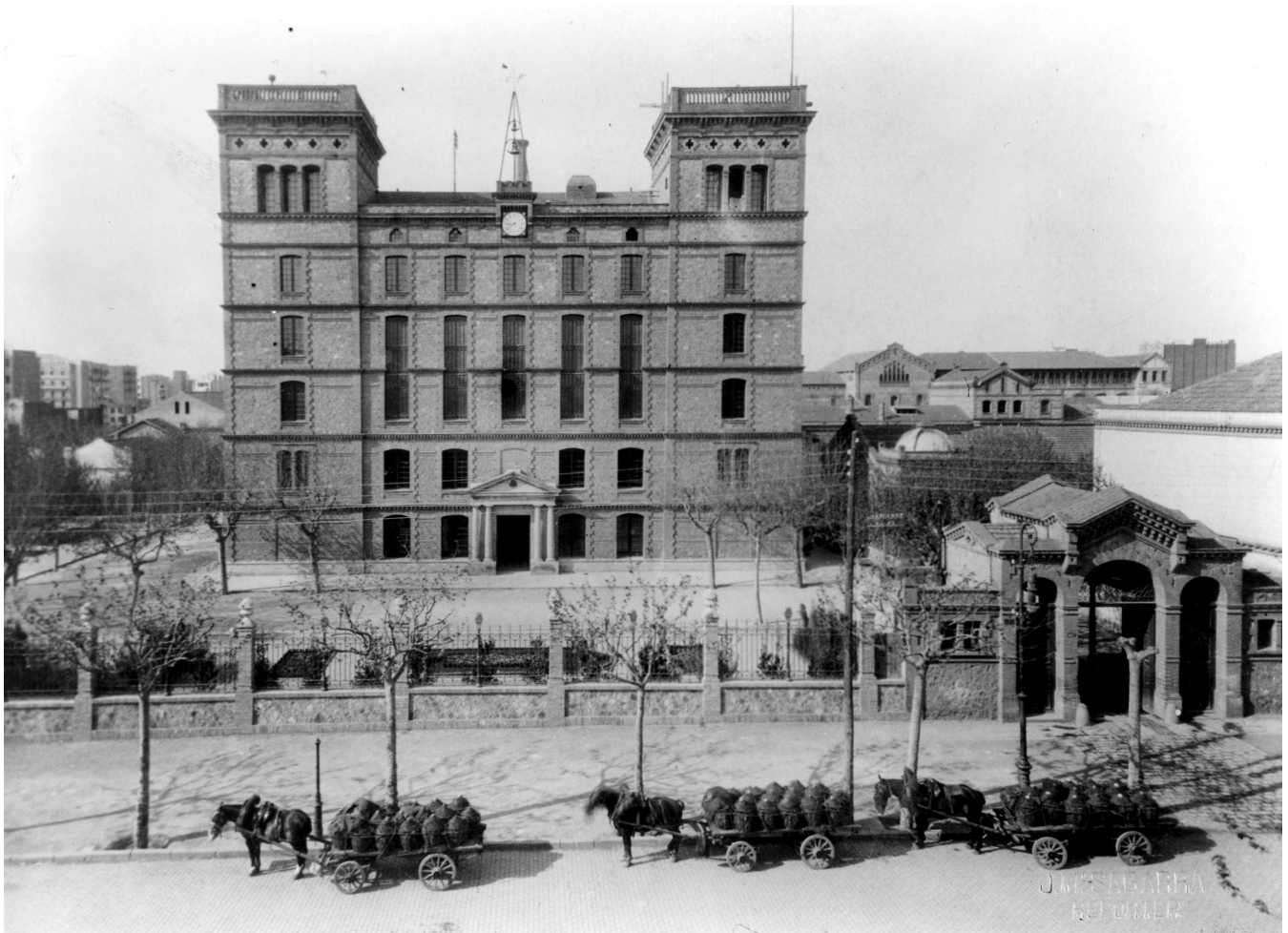
FIGURE 1. The Batlló factory with the old entrance to the premises and the spinning building (now known as Edifici del Rellotge , or Clock Building).

The main façade of the building is symmetrically composed around a central axis which is emphasised by the presence of a clock (hence the current name Edifici del Rellotge , or Clock Building) and a gable two storeys tall (which was replaced by an iron pyramid with a weathervane in the early 20th century). It is framed by two rectangular corner towers which stand one storey taller, with flat roofs bounded by a rail and each with its own staircase and water tank on top. The outer walls of the building are made of smooth stone ashlar with highlighted joints, and each storey is delimited by the impostes on the walls, which also stand out from the plane of the façade. Their horizontality contrasts with the verticality of the regular lines of large windows topped with segmental arches, which illuminate the inside of each storey. The stretches of stone walls are delimited by brick edges and finishes, which confer architectural quality: the impostes and corners of the towers, the cornices of the moulds and dentils, the rear pediment, and the jambs, boundaries and arches of the openings outline the stone