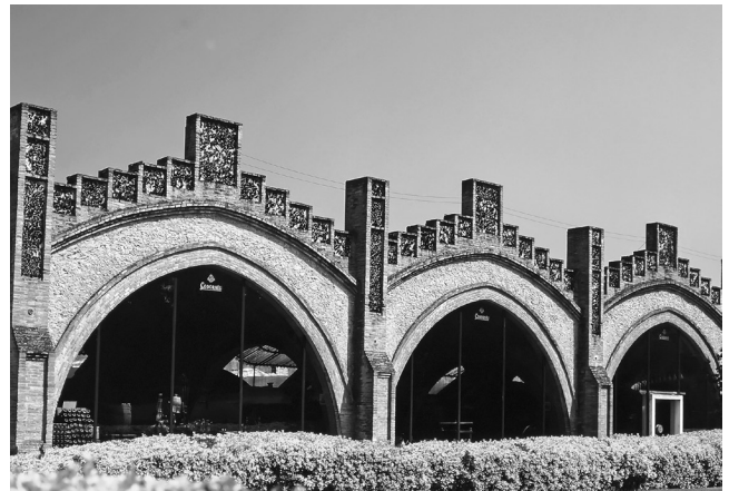
FIGURE 6. Sant Sadurní d’Anoia. Caves Codorniu.

In 1895, he came up with the idea of creating a large cava complex around the old Codorniu estate, and he commissioned architect Josep Puig i Cadafalch to design a series of buildings, both industrial and residential, and to urbanise the gardens around them. Construction took 20 years. The set of historicist Modernist buildings includes