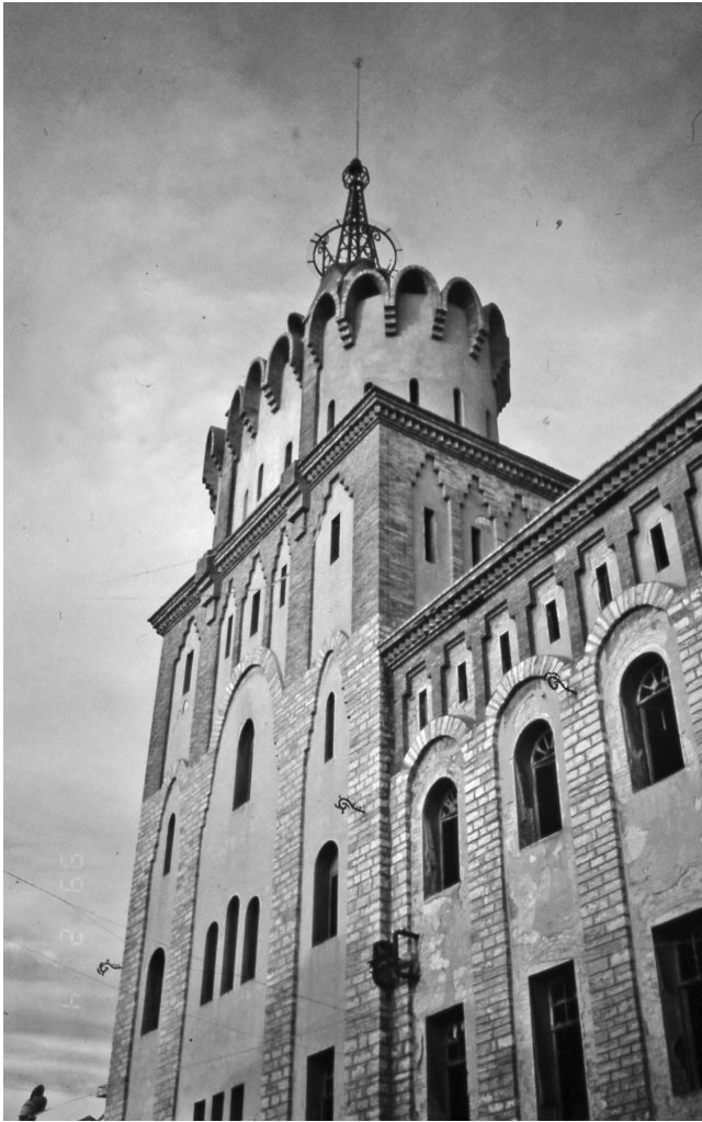
FIGURE 9. Flour mill of the Sindicat Agrícola of Cervera and its county. Close-up of the façade and the water reservoir. Photo: R. Lacuesta, 2012.

expanded in 1915-1923), at number 42 Carrer de Santa Eugènia in the city of Girona, the work of architect Rafael Masó i Valentí (Girona, 1880-1935), and the Sindicat Agrícola flour mill in Cervera (1920-1922) designed by Cèsar Martinell.