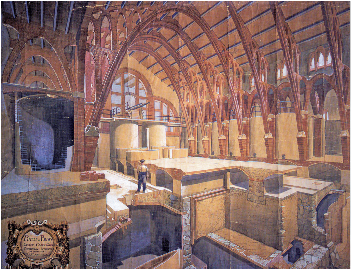
FIGURE 7. El Pinell de Brai. Winery of the Sindicat Agrícola. View of the interior with a structure of balanced arches. 1918.

structure made of cruciform pillars which supported the diaphragm arches that shaped the interior spaces (inspired by the halls of the neighbouring Cistercian monastery of Poblet) and with formerets separating them, the former with concrete reinforced with two cross-wise layers of brick, and the latter made of rows of timber arches and twisted arches. 39 They are in the shape of Gothic arches with openwork spirals, also made of exposed brick, but enclosed with round arches and support the usual roof made of wood, ceramic tile and terracotta roof tiles. The vats, which are accessible from the upper part through aerial walkways, rest on four brick legs which generate a splayed arch and allow for ventilation, cleaning and movement around them.