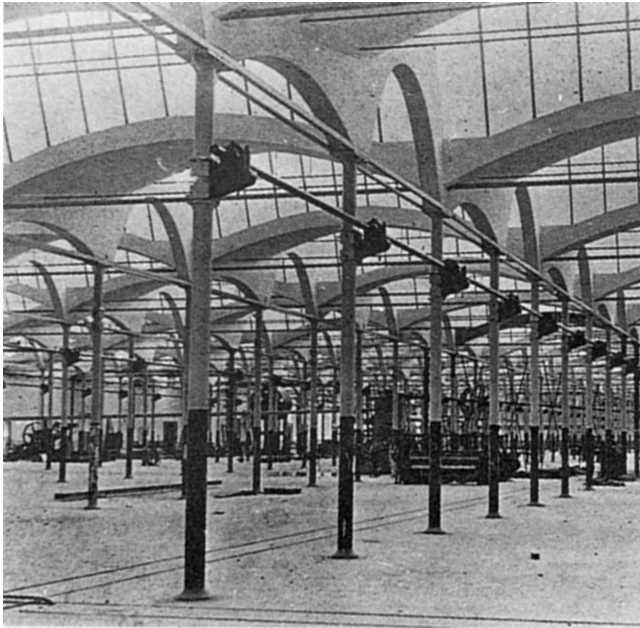
FIGURE 4. Interior of the Aymerich, Amat i Jover factory.

umes traced by moulded cornices. The four vaults of the main body are laid out parallel to the gable wall, while the three vaults on each wing are laid out perpendicular. The windows and doors have jambs and segmental arches decorated with patterned brick archivolts, a decorative but also structural device that the architect Muncunill cultivated in practically all of his buildings, both