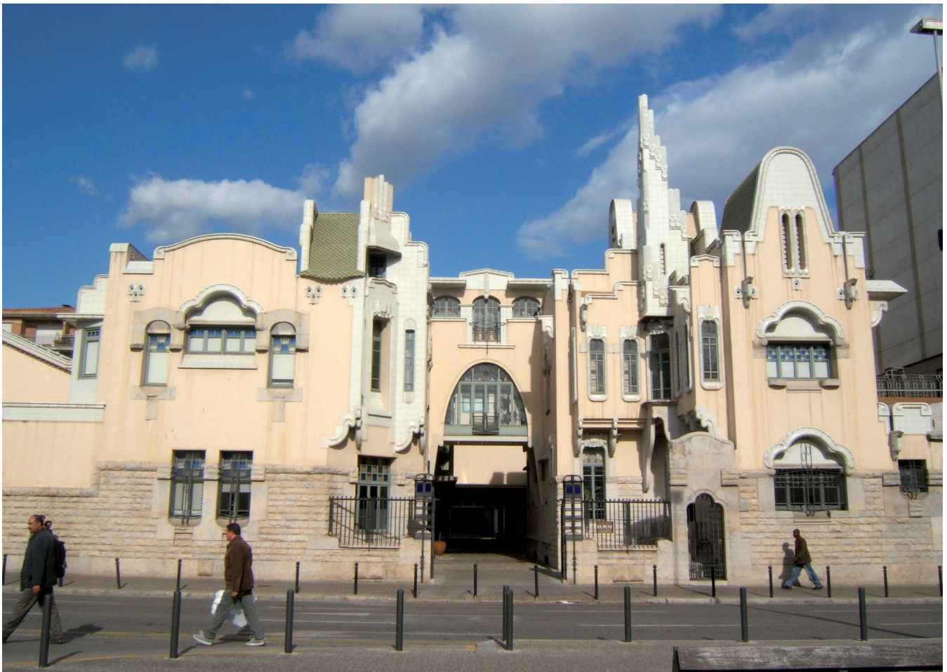
FIGURE 8. Girona. Teixidor flour mill, designed by Rafael Masó from 1910 to 1912.

We should finally mention a kind of agricultural industrial architecture that has also gone down in the history of Catalan architecture: flour mills. We have two beautiful Modernist examples: the Farinera Teixidor (1910-1911,